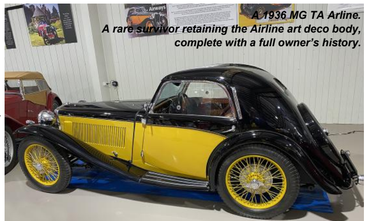
A 1936 MG TA Arline. A rare survivor retaining the Airline art deco body, complete with a full owner's history.